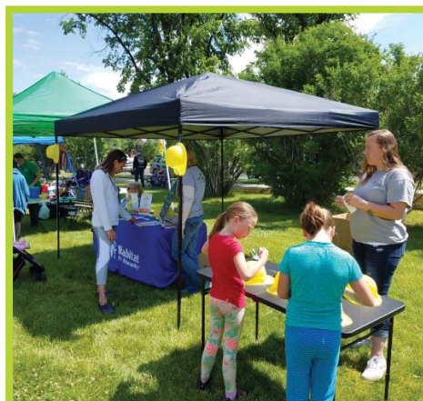
CHA Father's Day Event April 2018