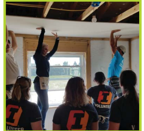
First Interstate Bank June 2018