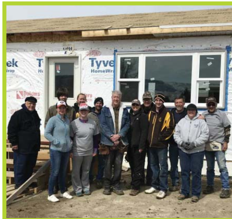
Kiwanis Club April 2018