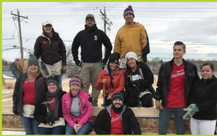
29° Wells Fargo January 2018