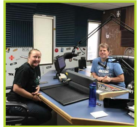
Radio Interview - 100.5 KTED Casper's Pure Rock Breck Media Group