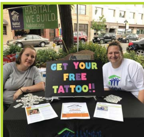
Downtown Art Walk Breck Media Group Refreshment Booth