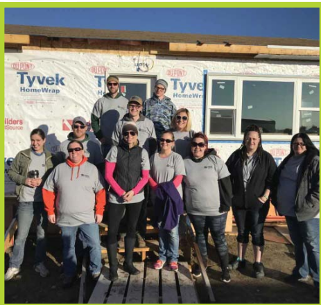
'Dream Team' March 2018