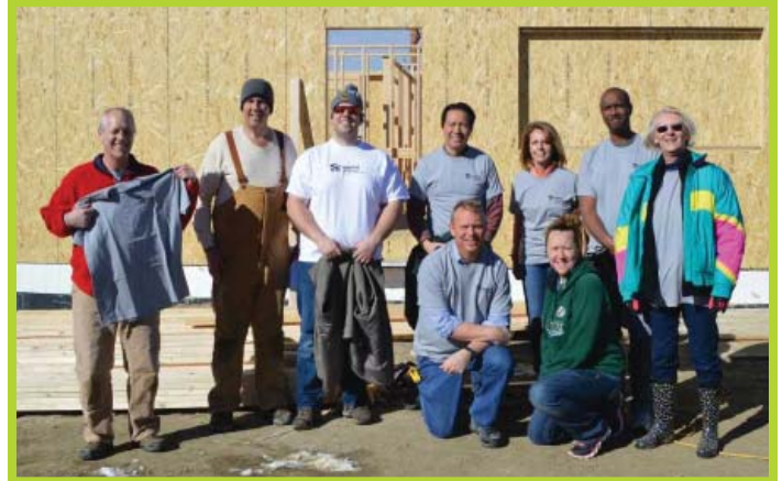
36° WCDA February 2018